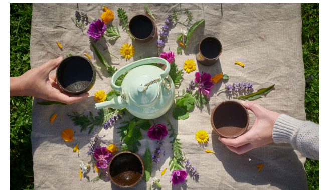
Zeliščni vrt

Luče, 📅 09:00, 11:00, 13:00, 15:00, 17:00 Snežna Jama Cave (Guided Tour) i Jamarski Klub Črni Galeb Prebold ☎ +386 41 424 091, €15/person (children, students €10/person) ⌚ 1.5h 📍 Snežna Jama Cave ! Warm clothing and hiking boots are required.