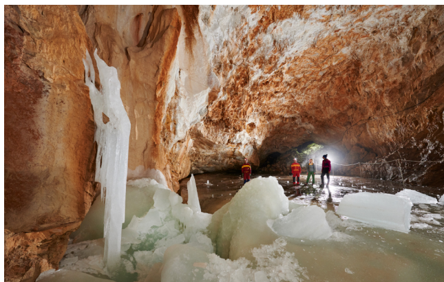
Snežna jama